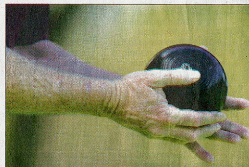
Hands cradle a bowl before a shot Saturday on the Santa Cruz Lawn Bowling Club's green.